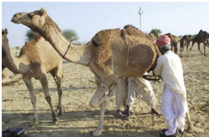
Camel milking in Khaba

By Drynet partner: Ilse Köhler-Rollefson, LPP, Germany