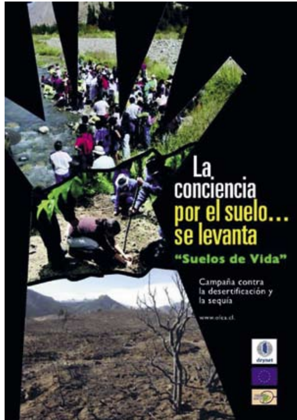
Promotional poster of the radio campaign, "Suelos de Vida" or "Lands of Life".