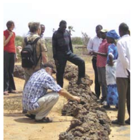
Regional Meeting in Africa. Drynet team visits a farmer's field outside Dakar, Senegal

By Drynet partner: Both ENDS, the Netherlands - drynet@bothends.org