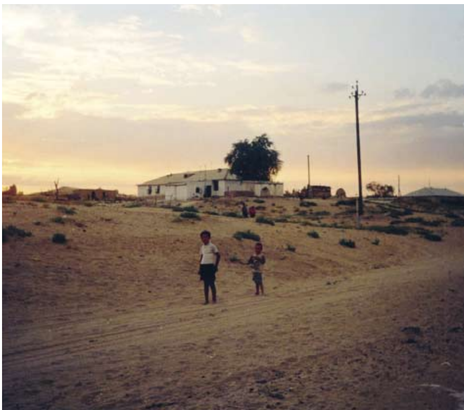
Village in Central Asian Desert

The alteration of the vegetal cover (deforestation, fragmentation of habitat) caused by drought and human activities are actual evidence of these environmental disturbances with harmful effects on both human and animal health (Patz, 2005). Some of these disturbances can directly or indirectly interfere with