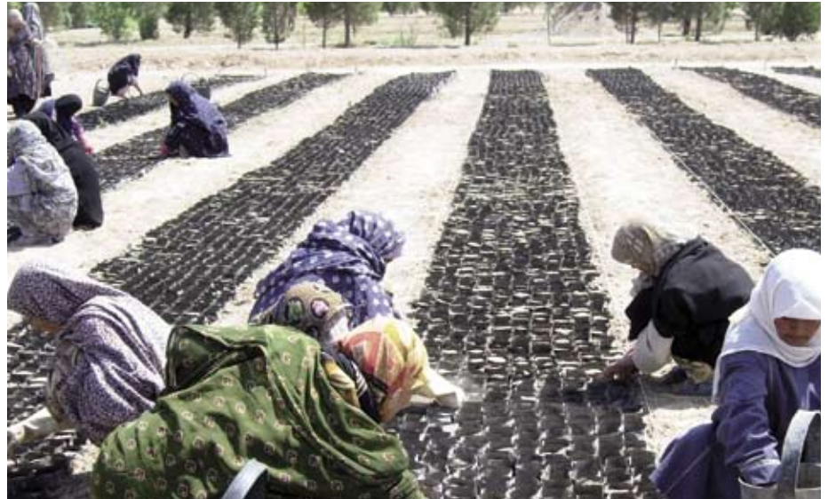
Women planting seedlings in Iran.

It is widely recognized that traditional varieties (landraces) have much greater resilience to drought and other stresses. Some of the landraces that have been lost due to the introduction of Green Revolution technologies are available in national and international gene banks. These gene bank collections serve a