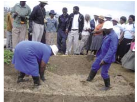
Dryland farmers learning new technologies and methods as part of the 'Partnership for Sustainable Agriculture'.