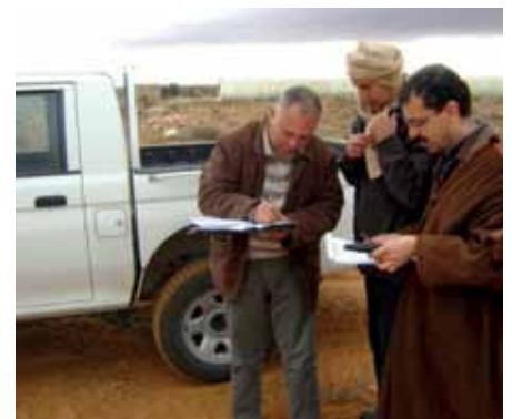
DESIRE project field work

For more details on the articles published you can check our website www.dry-net.org or contact us at drynet@bothends.org .