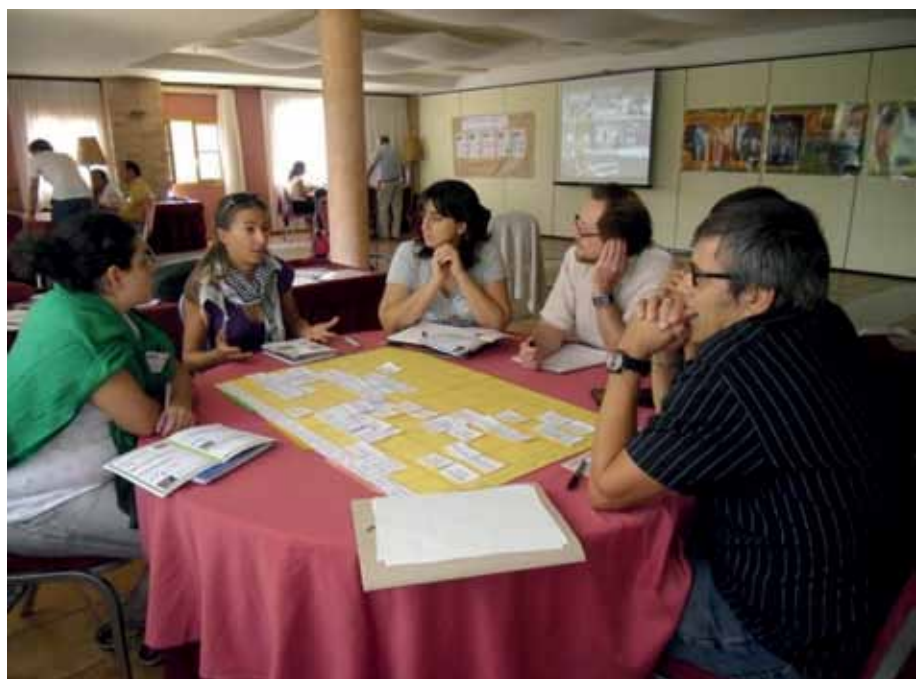
DESIRE Project Participants