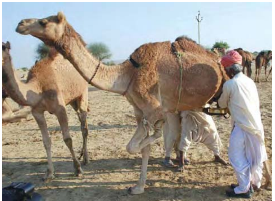
Camel milking in Khaba - Photo courtesy of the author

By Drynet partner: Ilse Köhler-Rollefson, LPP, Germany