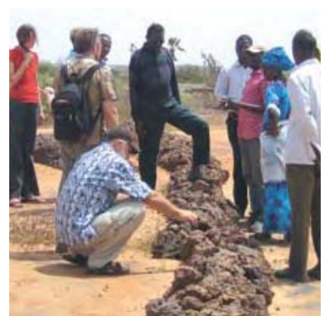
Regional Meeting in Africa. Drynet team visits a farmer's field outside Dakar, Senegal

By Drynet partner: Both ENDS, the Netherlands - drynet@bothends.org