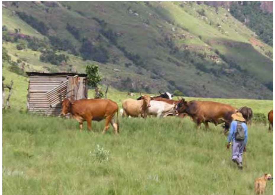
Mountain grazing area – photo by Victor Bangamwabo

Students and co-researchers work together as a team. They develop