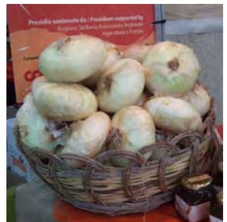
Giant onions on display at one of the food stands at the Slowfood Food fair 2008 in Italy