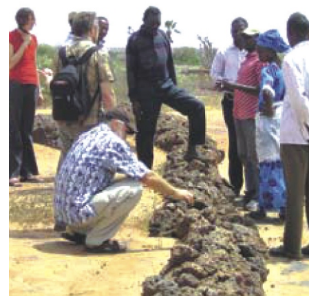
Regional Meeting in Africa. Drynet team visits a farmer's field outside Dakar, Senegal

By Drynet partner: Both ENDS, the Netherlands - drynet@bothends.org