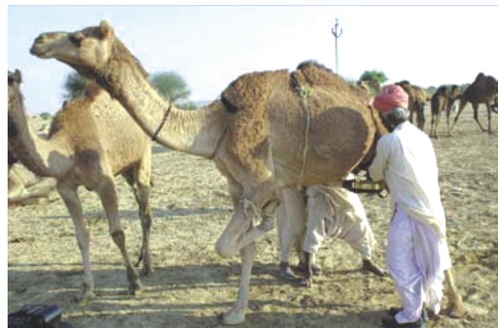
Camel milking in Khaba